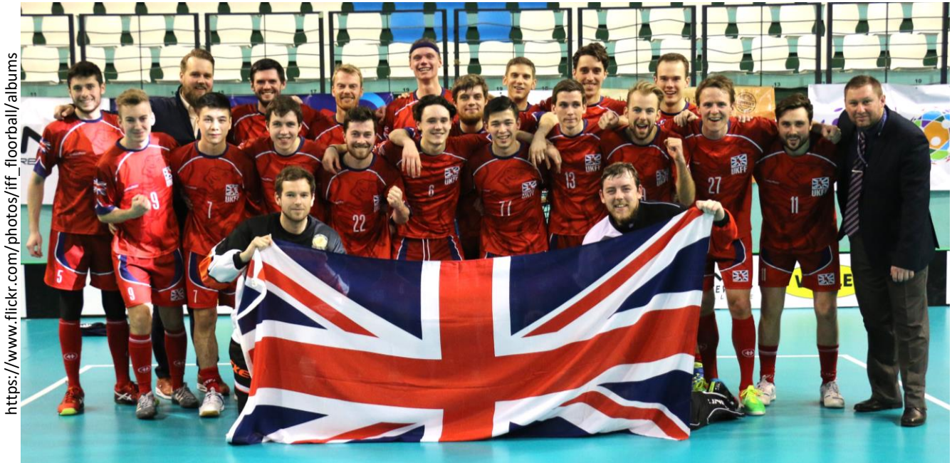
5 ex-Fireballs were selected for Team GB in Slovakia